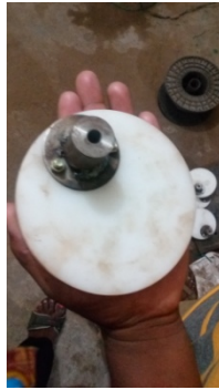
Fig. 2: CAM

Therefore the design must be as perfect as possible and special attention is given during each manufacturing activity. In the manufacturing we come to know how theoretical aspects are implemented in actual practice, we got to learn about different manufacturing processes, welding, gear, cutting etc.