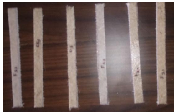
Fig.3: Flexural test specimen of various laminates