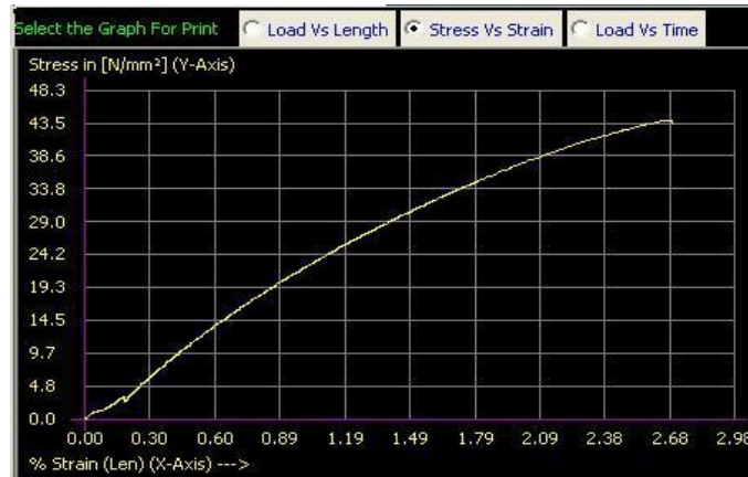
Fig. 5: Stress Vs strain curve (GSGBG)