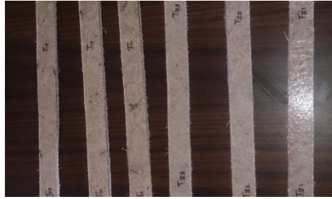
Fig.1: Tensile test specimen of various laminates