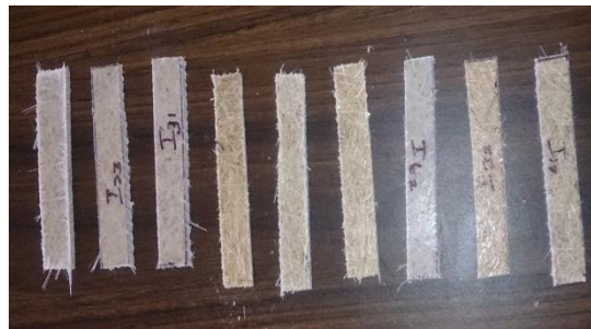
Fig.2: Impact test specimen of various laminates.

A flexural test imposes tensile stress on the convex side and compressive stress on the concave side of the specimen which causes a shear stress along the centre line. It measured the force required to bend the beam. The flexural test was performed on the KA LPAK UTM (Model no. KIC-2-0200-C with a capacity of 20 kN). The geometrical dimension of the nominal specimen was made according to the standard ASTM: D790. The specimens were placed between two supports at a distance of 50 mm and the load was applied at the centre which is called as three point bending test. The load was applied at a rate of 5 mm/min till the specimen fractures and breaks. The fabricated specimen for the flexural test is shown in the Fig. 2. The maximum load at failure was used to calculate the flexural stress.