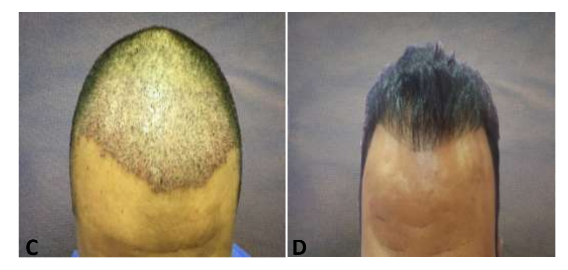
(C) 3 Months Post-operative (D) 6 Months Post-operative

The evaluation was done by analysis of preoperative and postoperative of follicular unit extraction hair transplantation and throughout the time of wound healing and complication management if occurred up to 6 months by Patient satisfaction questionnaire, scalp redness, hair density, length, direction & texture by using Trichoscopy (DermLite® San Diego, California, USA) in the analysis at the end of 2 weeks, 4 weeks, 8 weeks, 3 months and 6 months.