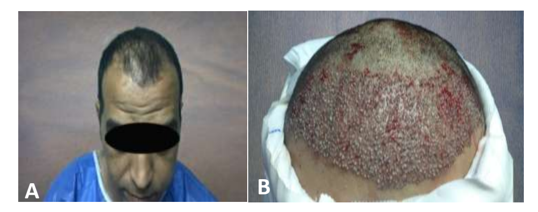
(A) Pre-operative (B) After Grafts Insertion